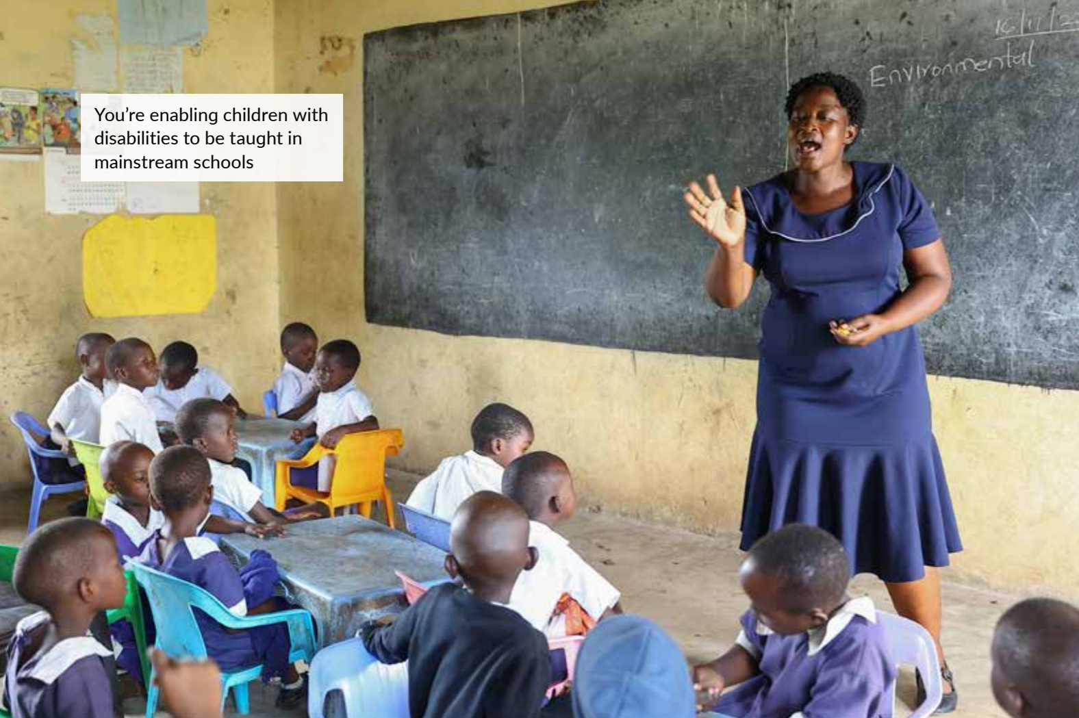
You're enabling children with disabilities to be taught in mainstream schools