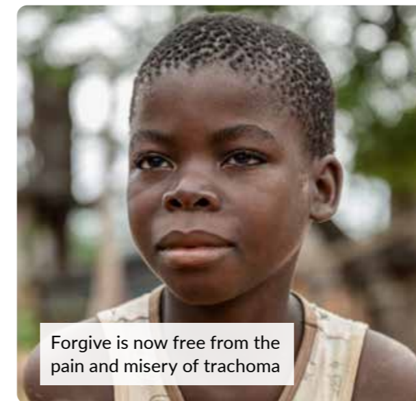
Forgive is now free from the pain and misery of trachoma